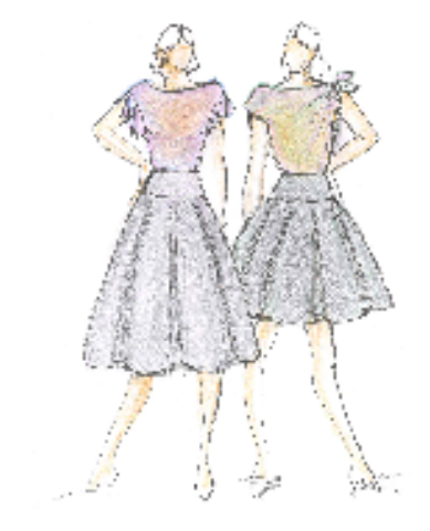
Fig. 3-3. Target model in the multifactor design